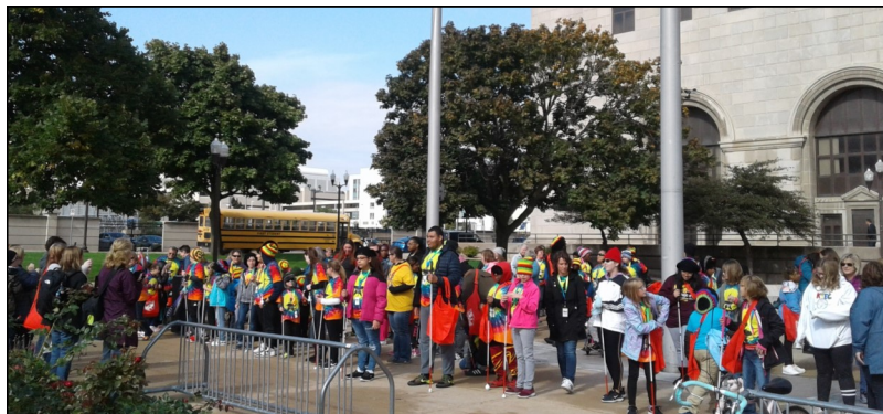
A beautiful, colorful White Cane Day 2019!

In September, the ABLE Board of Directors brought together friends and colleagues for a tour of the newly remodeled ABLE office. Staff and volunteers demonstrated the process of making braille, tactile and audio materials. One of the highlights of the evening was a tour of the Milwaukee Public Library Green Roof. What a treat! If you would like a tour of the ABLE office, give us a call at (414) 286-3039. For tours of the MPL Green Roof, check out the MPL website or call (414) 286-TOUR (8687).