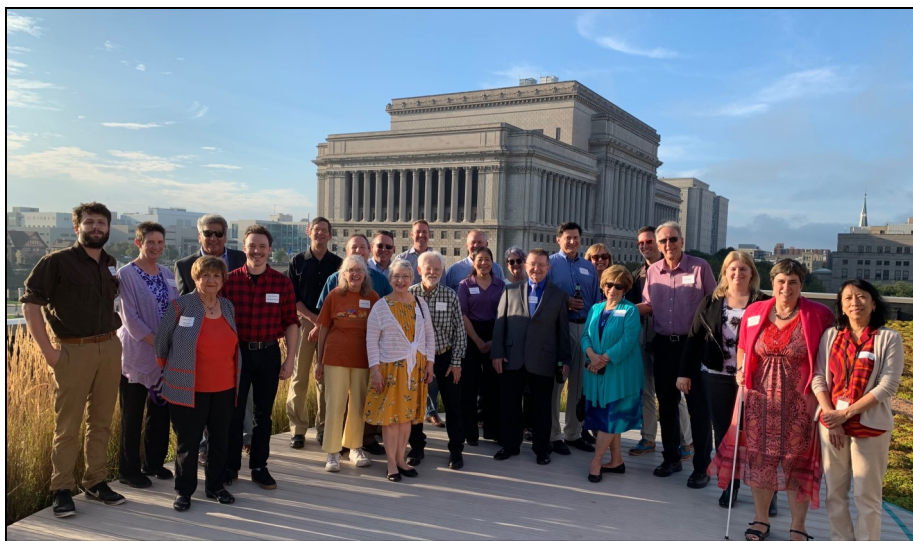
Friends and colleagues enjoy the Milwaukee skyline from the Milwaukee Public Library Green Roof

In September, the ABLE Board of Directors brought together friends and colleagues for a tour of the newly remodeled ABLE office. Staff and volunteers demonstrated the process of making braille, tactile and audio materials. One of the highlights of the evening was a tour of the Milwaukee Public Library Green Roof. What a treat! If you would like a tour of the ABLE office, give us a call at (414) 286-3039. For tours of the MPL Green Roof, check out the MPL website or call (414) 286-TOUR (8687).